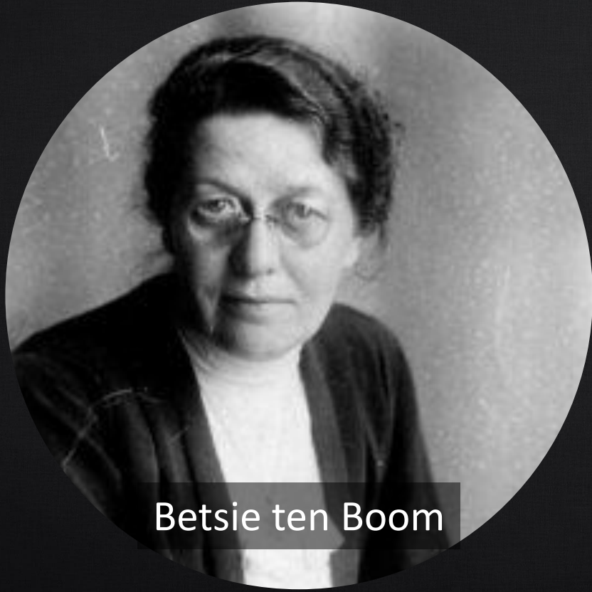
Betsie ten Boom

“And I wondered, not for the first time, what sort of a person she was, this sister of mine... what kind of road she followed while I trudged beside her on the all-too-solid earth.”