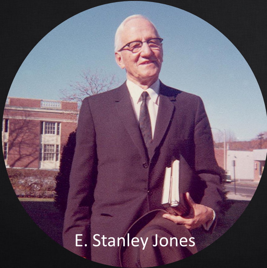
E. Stanley Jones

“The development of character, rather than direction in this, that, and the other matter must be the primary purpose of the Father.... The parent must guide in such a manner, and to the degree, that autonomous character, capable of making right decisions for itself, is produced. God does the same.”